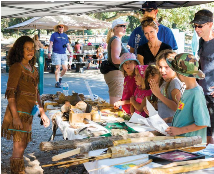
Silverwood's 2017 Acorn Festival brought many appreciative visitors. The cultural history of the indigenous Kumeyaay is central to our mission.

In 2008, Barona Indian Charter School (BICS) began regular Silverwood trips. The Silverwood staff and volunteers, in coordination with BICS, developed a program to complement the school's science curriculum. Although BICS piloted this outdoor education initiative, it has been broadly incorporated into nature education programs by home school, charter, public schools, and