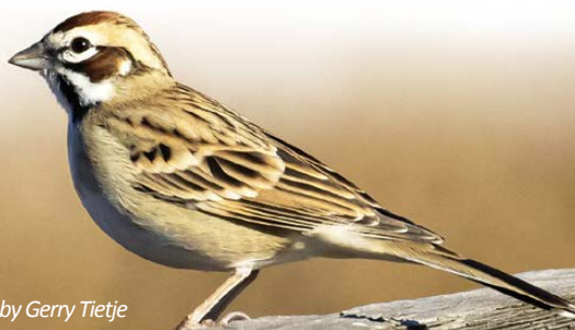
Lark Sparrow by Gerry Tietje

Please follow our Birdathon webpage for recommendations and pandemic guidelines.