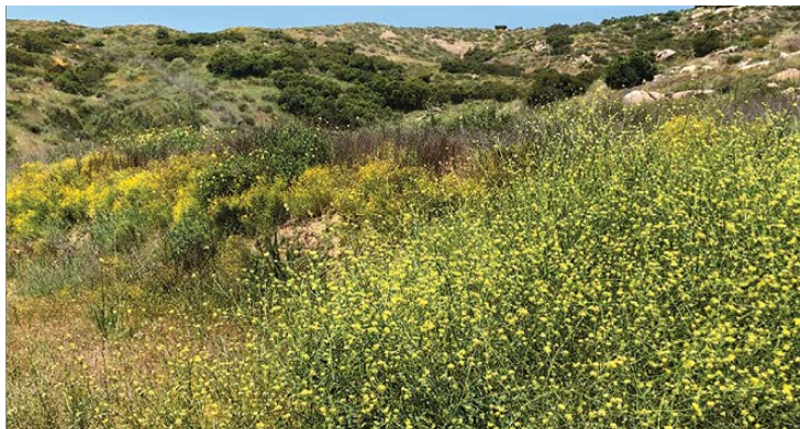
Black Mustard blankets thousands of acres throughout California

Preregistration is required. Please visit our website for more details at: www.sandiegoaudubon.org/what-we-do/anstine.html