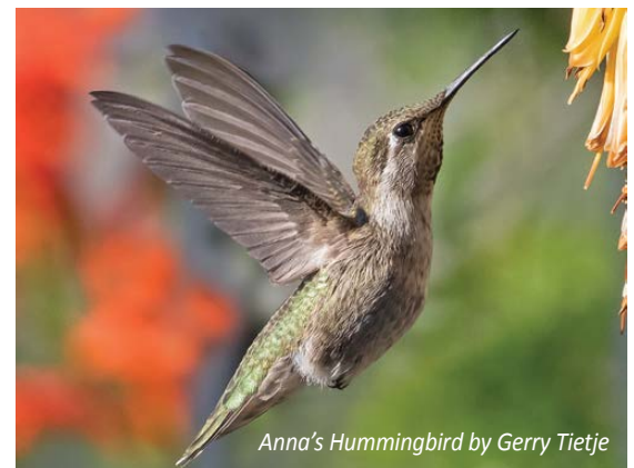
Anna's Hummingbird

You must RSVP in order to attend. You can register on the SDAS website. Go to the calendar, find the event you want to attend, and click on it. Then click "register" to let us know you are joining. We'll send you reminders and links prior to the program.