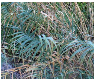
Arundo donax, Giant Reed

Recent reports of species loss from conservation organizations such as the World Wildlife Fund (WWF) and the National Audubon Society have noted the massive decline in both numbers and diversity of birds and other wildlife. Globally, wildlife populations have dropped 60% between 1970 and 2014, and that decline has continued to worsen.