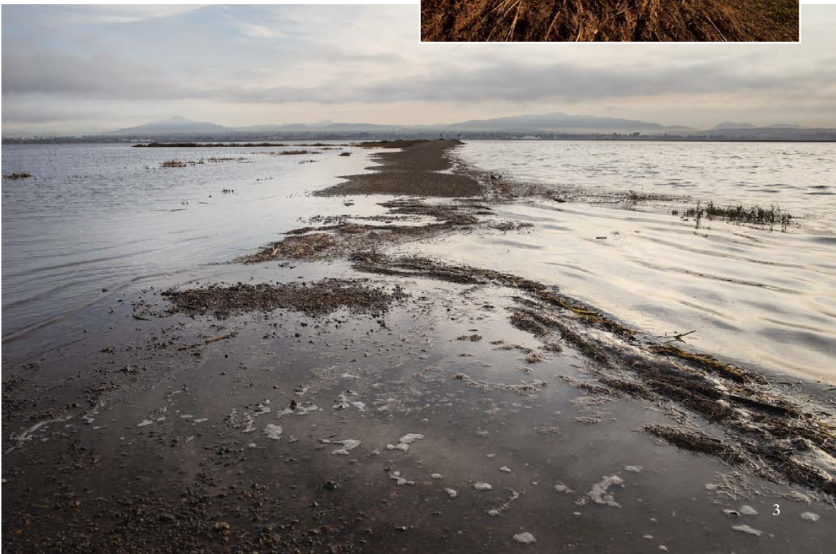
Kendall-Frost Marsh (inset, below) at Low Tide, Nov. 27, 2019. The marsh habitat is active.