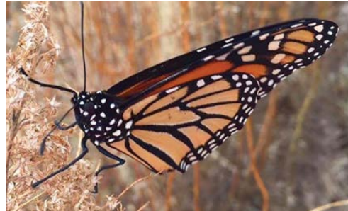
Clockwise: Honey Bee, Monarch Butterfly, and Mason Bee.

species, new life is created through the formation of seeds, which provide future generations wherever the seeds are dispersed.