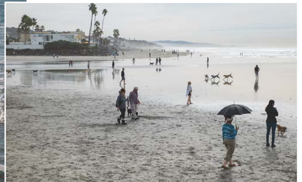
Dog Beach, Del Mar. King Tide, Nov. 11, 2019. The beach is flooded; no place for dogs or people. (Inset) shows normal tide.