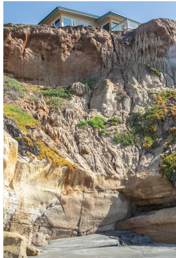
Seaside Beach, Solana Beach. Unstable cliffs, Feb 8, 2020. Big waves are eroding and cracking cliffs. Homes are threatened.

PRINCIPAL SCIENTIFIC REFERENCES: NASA, Global Climate Change, Vital Signs of the Planet, NOAA, Global Sea Level, and Observations from Space, US Global Change Research Program, Fourth National Climate Assessment; Impacts, Risks, and Adaptation in the United States .