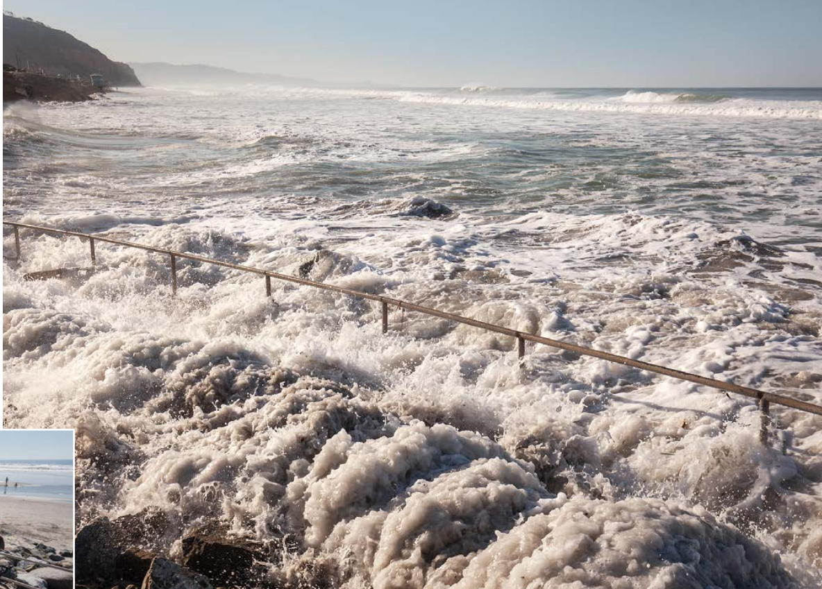
(Inset, below) Same path under Pacific Coast Highway, Torrey Pines State Beach, A normal day, Feb. 17, 2020. The path is well used during regular tides.