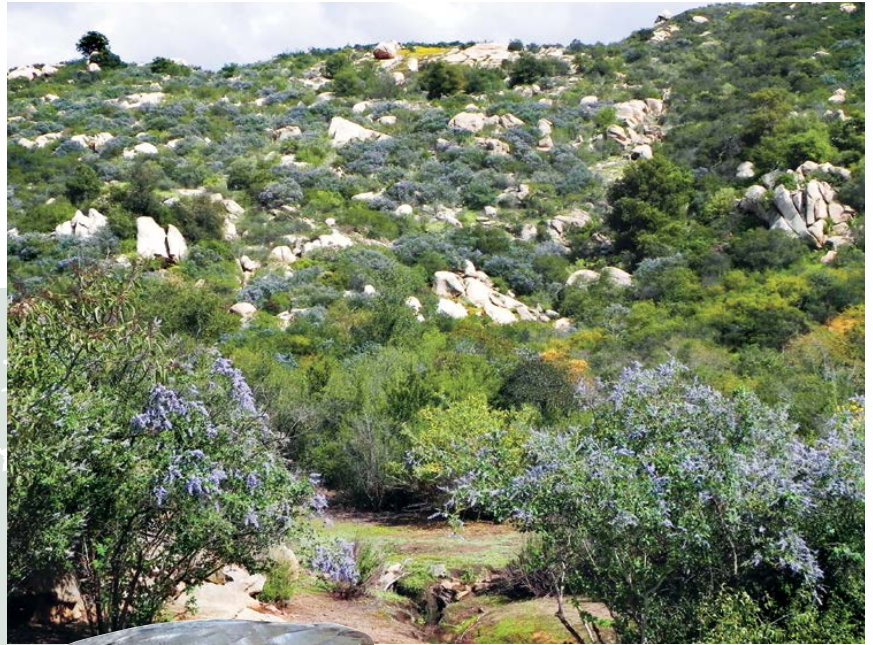
Ceanothus and Bush Poppies carpet the Silverwood slopes, while dozens of other native plants bloom or prepare to bloom.

When Silverwood reopens, we will have major needs in trail maintenance and other tasks. Please consider how you can help when the gate swings open once again.