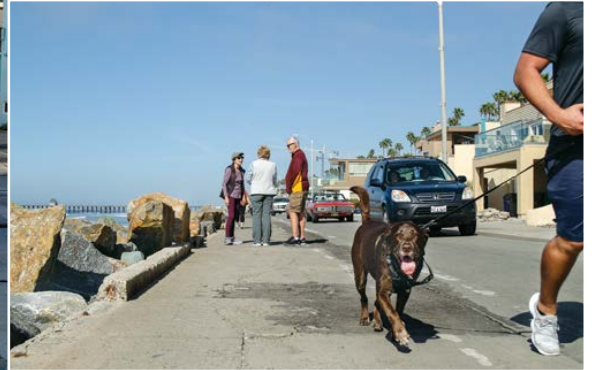
Oceanside Strand, Nov. 24, 2019. King tides threaten homes and lower property values. (Inset) normal tide.

This series of King Tide photographs helps to bring home what sea-level rise will look like for San Diegans in the coming decades. The remarkable photographs are evocative in a way that no statistical report or story can be.