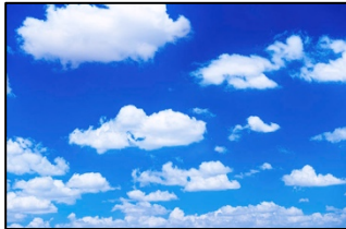
White, Puffy Clouds

And if clouds are long and thin, they're probably high up in the sky and this tell us the weather is going to change soon.