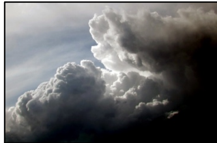
Dark, Storm Clouds

Predicting weather is a science called meteorology . Meteorologists use clues to predict weather and one of the ways they do this is by observing clouds. Different clouds mean different things about the weather. For example, if clouds are dark and tall like mountains, it might mean a storm is on the way. If clouds are white and puffy, it probably means the weather will be nice for a while.