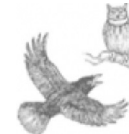
Alarm Call (making a loud noise)

Draw a bird in the box below. It can be a bird you see or a design of your very own.